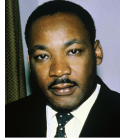
Dr. Martin Luther King, Jr. In Remembrance