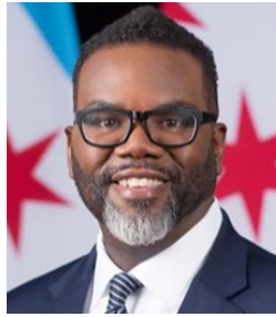
Honorable Brandon Johnson, Mayor, City of Chicago Invited Speaker