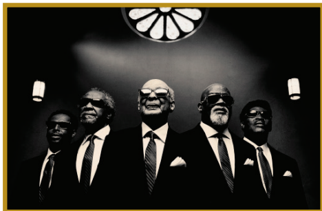
FEATURING THE BLIND BOYS OF ALABAMA