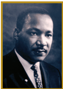
REMEMBERING DR. MARTIN LUTHER KING, JR.